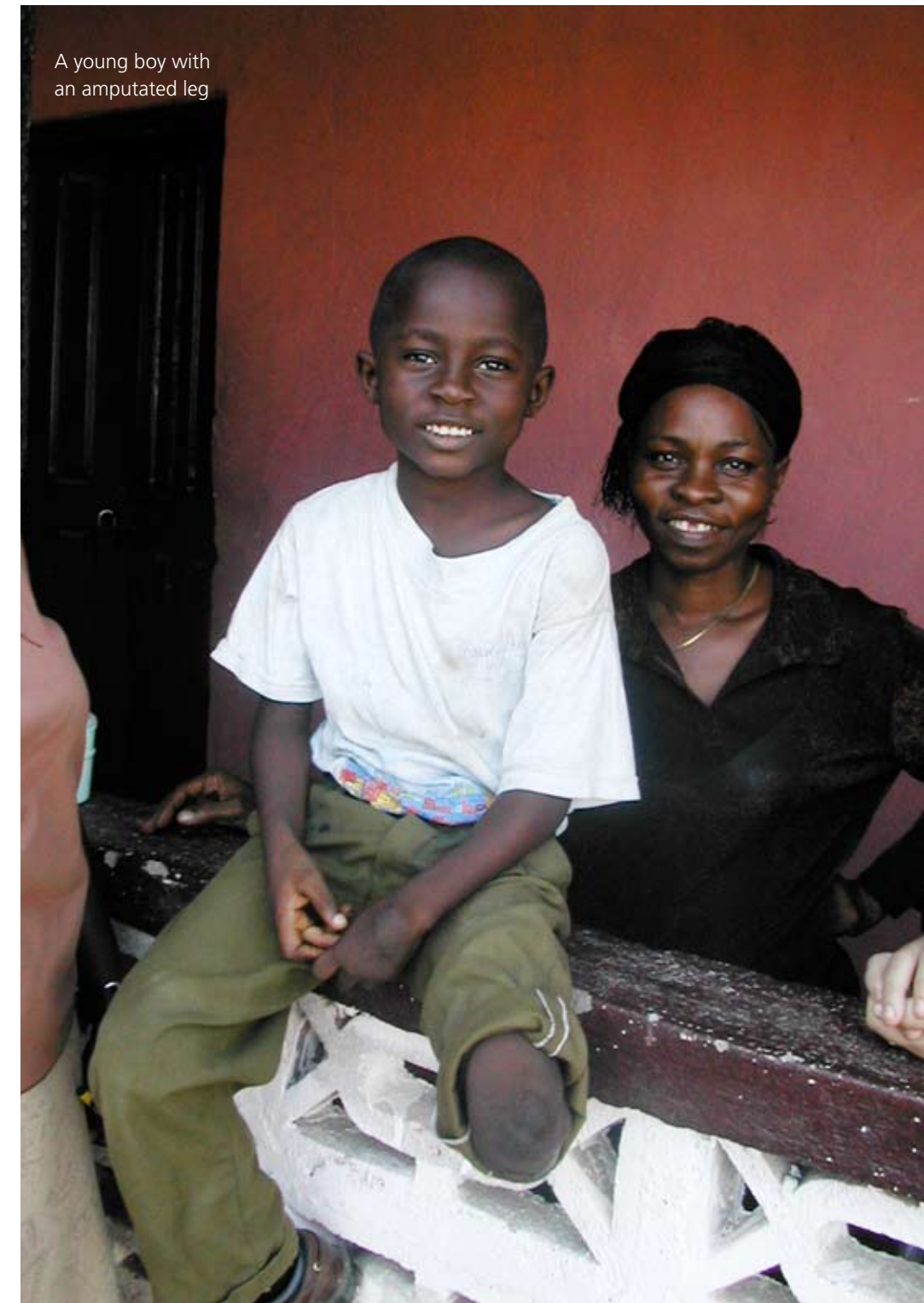
A young boy with an amputated leg

ideal location for the home. Robertsport, with its incredible potential for ecotourism, especially as a surfing and beach destination, and a peaceful Muslim and Christian community of 6,000 was exactly what they were looking for. Town meetings open with a Muslim prayer and end with a Christian prayer and Muslims help rebuild the roofs of the churches for the town's Christians. Another important component of what confirmed Robertsport and Liberia as the setting of the Strongheart House was that the new Liberian President Ellen Johnson Sirleaf was leading the country in